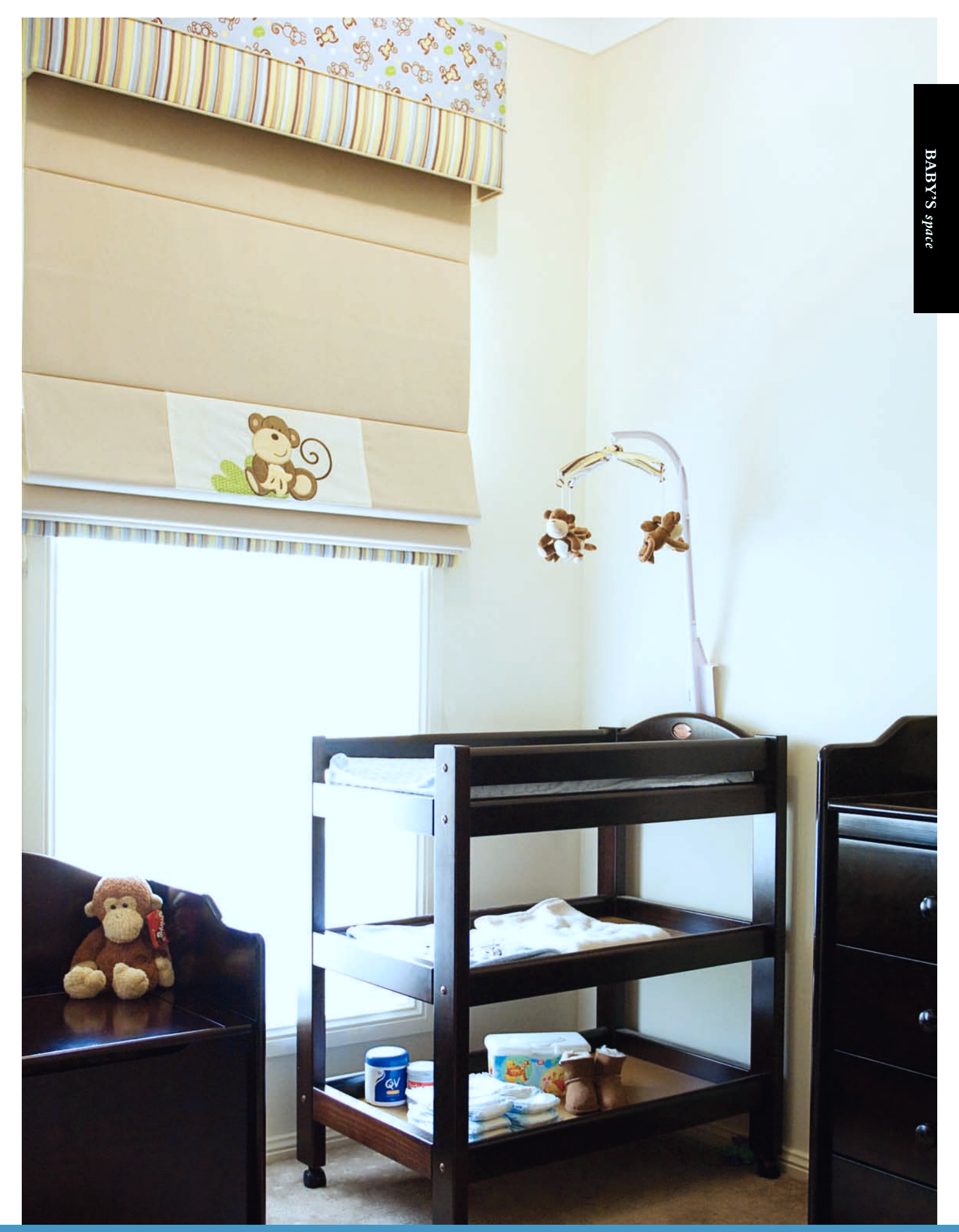
COLOURS MUTED AND INCLUDING LIGHT AND SPACE.